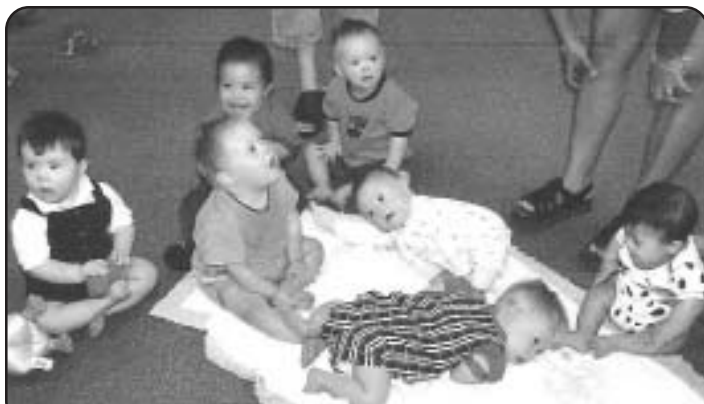
It's All Boys at the July Early Childhood Meeting!